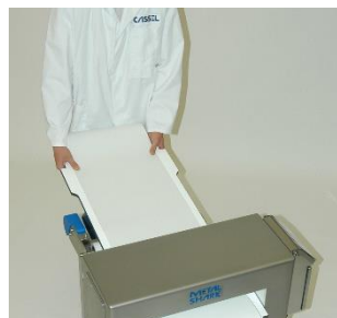
Pull the PU belt as well as the sliding plate out 3ft the unit.