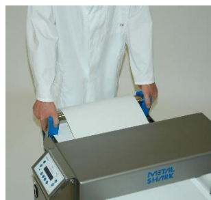
Fold the guide of the deflection roller upwards.

Conveyor belts of the HW series are particularly easy to clean because they can be dismantled very easily.