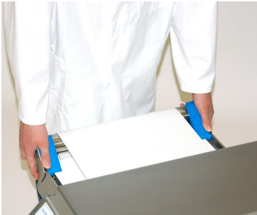
Conveyor HW - particularly easy to dismantle for quick cleaning.