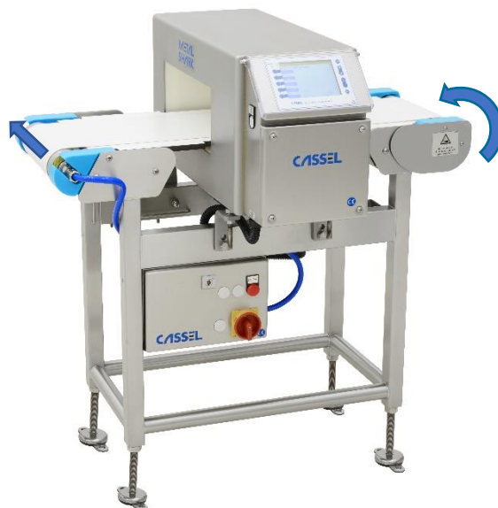
Simply fold up the right side to take tension off the belt. Now you can easily remove the deflection rollers on the left and right.

The standard range is available in two lengths (1,000 mm and 1,200 mm) and two belt widths (250 mm and 350 mm).