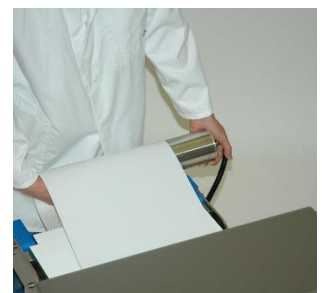
Go to the other side of the conveyor and remove the deflection roller there.