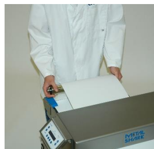
Now you can easily remove the Pulley from its guide.