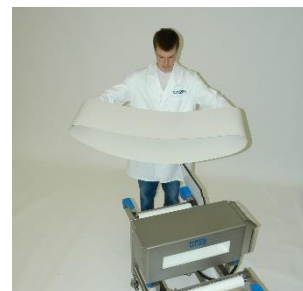
Remove the PU belt completely from the sliding plate.